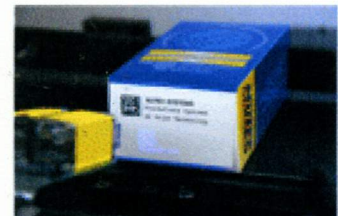
Serialized 2D Bar Code Lot & Expiration Date