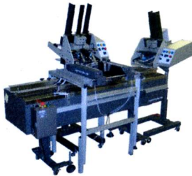
BD-2 System Pictured