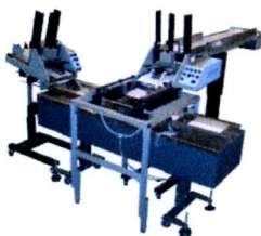
BD-2 System with XM-100 Bulk Product Feeder

This system is available in different configurations that allow for multiple batch counts and cover sheet placement.