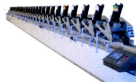
32-Station high-speed system