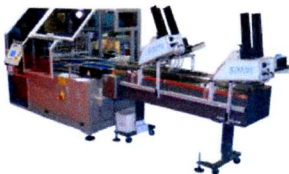
2-Station system with Shrink Wrapper

The heavy-duty, robust design will provide years of dependable service with little maintenance required.