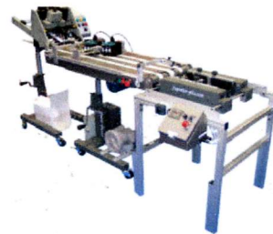
Used in this system as an addressing base