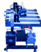
Used in this system as a compact roll in / roll out 2" HP addressing system