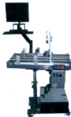
Used in this system as an output verification of pre-printed material