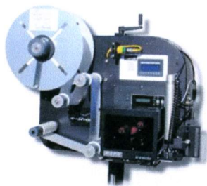
Panther 2000 Print and Apply Labeling System

The Panther CUB has the fastest dispense speed in the industry!