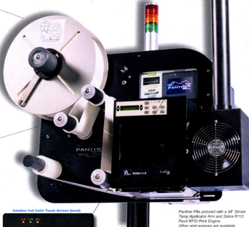
Panther P8e pictured with a 38" Stroke Tamp Applicator Arm and Zebra R112 Pax4 RFID Print Engine. Other print engines are available.