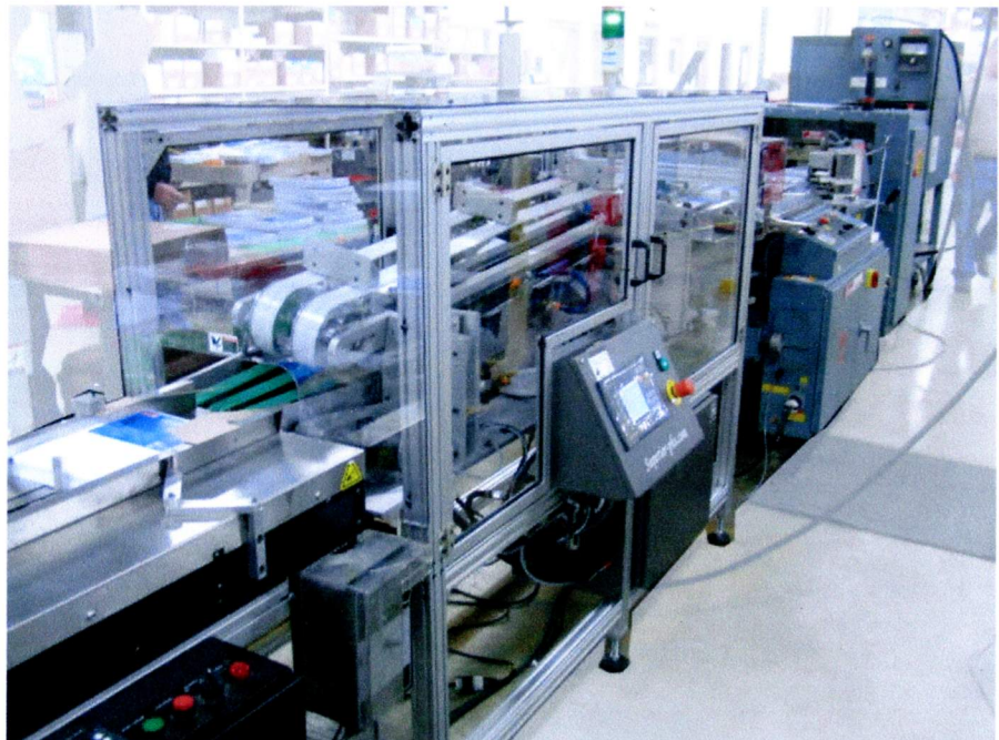
Shown here as part of a turnkey Collating, Retail-Squaring, Shrinkwrap System

Superior-PHS can provide any combination of integrated modules for your application or a complete turnkey system tailored to meet your specific application requirements.